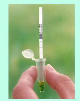
Add a test strip, wait 10 minutes