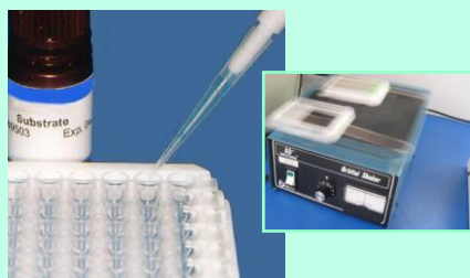
Add substrate, mix, incubate

wells each of Leaf Extraction Buffer and a known-negative tomato leaf extract be run on each plate. Additional quality control samples may be added at the discretion of the user. Sample extracts may be run in either single or duplicate wells.