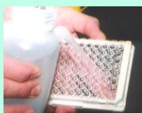
Bottle Wash method