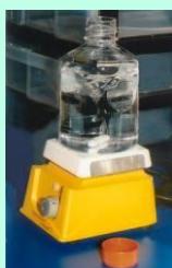
Prepare wash buffer