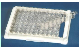
Remove unneeded strips