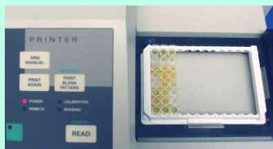
Read plates in a Plate Reader at 450 nm within 30 minutes of the addition of Stop Solution.