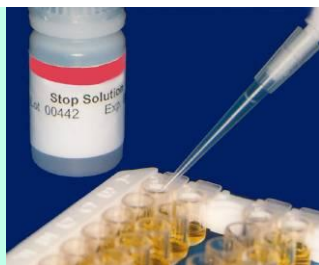
Add Stop Solution