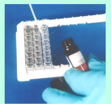
Add Extraction Buffer, controls, and sample extracts