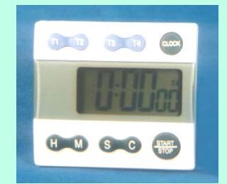
Add conjugate, mix, incubate, wash