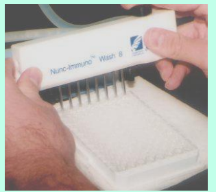
Strip Plate Wash option