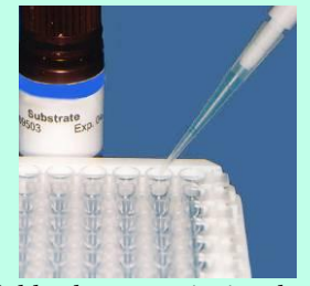
Add substrate, mix, incubate