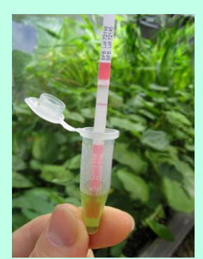
Add a test strip, wait 5 minutes