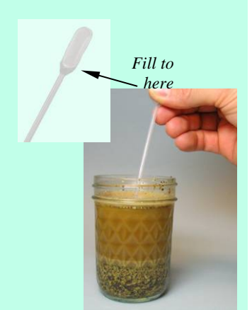
Avoid pulling up particles when drawing sample