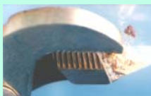
Crush single seed

Contact EnviroLogix to order bulk-packaged combs. Bulk kits include 20x Buffer Concentrate instead of EB2. To prepare, mix 50 mL Buffer Concentrate with 950 mL of distilled or deionized water. Store refrigerated when not in use; warm to room temperature before using.