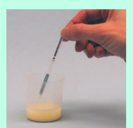
After 30 seconds, add QuickStix to cup

(outlined to demonstrate cup size and markings)