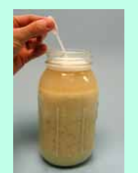
Avoid pulling up particles when drawing sample