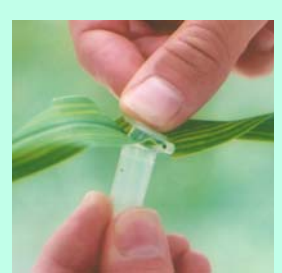
Obtain Leaf Tissue

Contact EnviroLogix to order bulk-packaged kits. Bulk kits include EB2 Extraction Buffer Concentrate. To prepare, mix 50 mL 20x Concentrate with 950 mL of distilled or deionized water per liter required. Store refrigerated when not in use; allow to come to room temperature before using.