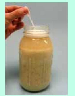
Avoid pulling up particles when drawing sample