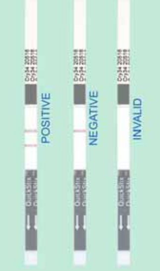
Any clearly discernable pink Test Line is considered positive