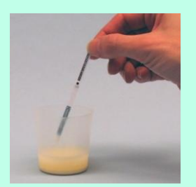
After 30 seconds, add QuickStix to cup

(outlined to demonstrate cup size and markings)