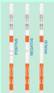
Any clearly discernable pink Test Line is considered positive