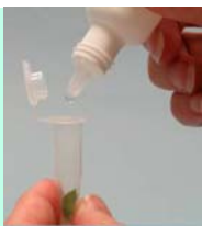
Add Buffer, then shake