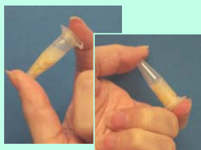
Extract seed sample— vigorous shaking is vital