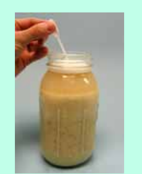
Avoid pulling up particles when drawing sample