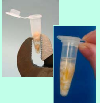
Crush single seed, extract