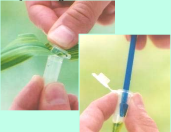
Obtain leaf tissue, grind