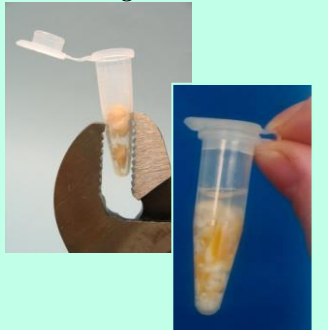
Crush single seed, extract