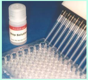
Complete protocol and add Stop Solution