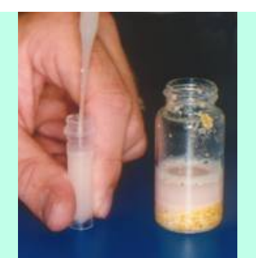
Extract grain sample