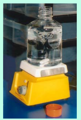
Prepare wash buffer and extraction solutions