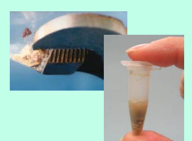
Crush single seed, extract