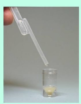
Add extract to vial