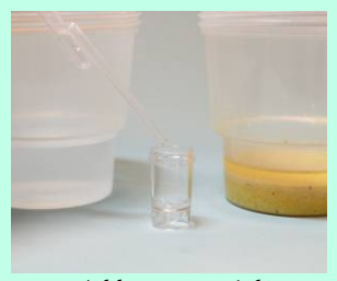
Add water to vial