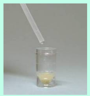
Transfer clear extract to vial