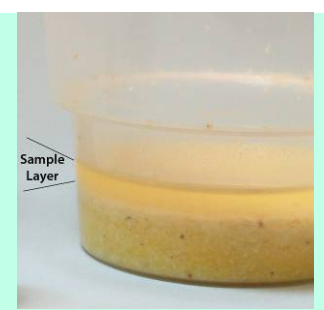
Allow to settle, or filter