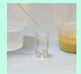
Get a new tip, add Buffer to vial, discard tip. Get another new tip, add extract, mix well, discard tip.