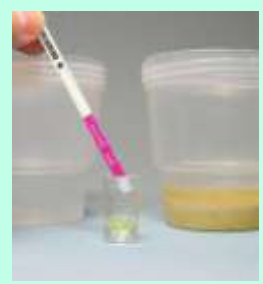
Place strip in vial Wait 10 minutes for results