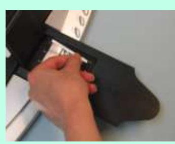
Place strip in QuickScan carrier

Cut strip and place in QuickScan reader immediately no drying step!