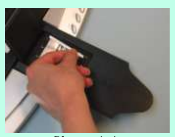
Place strip in QuickScan carrier