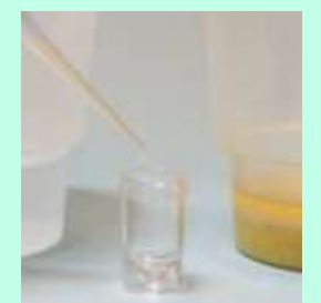
Add Buffer to vial first, then add extract; mix well with pipette tip