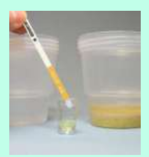
Place strip in vial