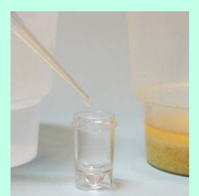
Add Buffer to vial first, then add extract; mix well with pipette tip