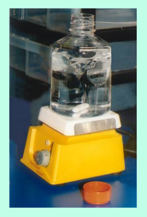
Prepare Wash and Extraction buffer