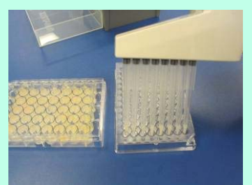
Add Enzyme-Conjugate, followed immediately by Control and sample extracts, to the plate