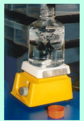
Prepare wash buffer and extraction solutions