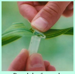
Punch leaf sample