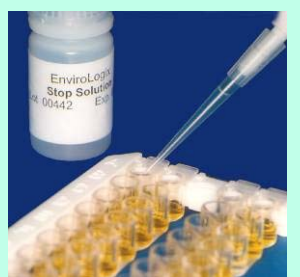
Complete protocol, then add Stop Solution